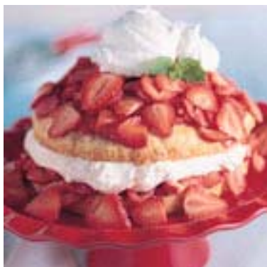
Strawberry Shortcake was delicious!